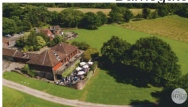
East Sussex National